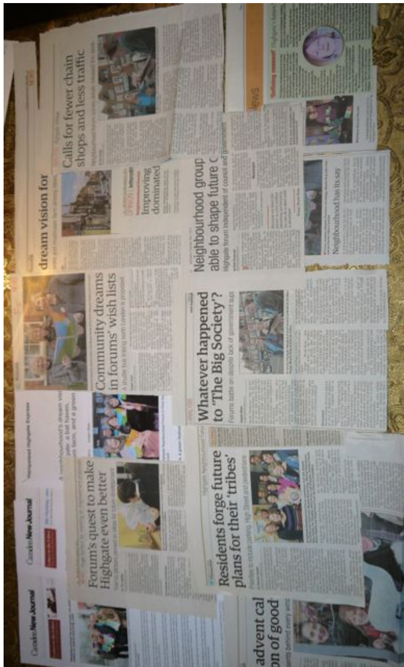
Fig 1: Articles in the Camden New Journal and Ham and High

In addition to regular articles in the Highgate Society's well-read Buzz magazine, the Forum has been very successful in gaining coverage in our two local papers – Camden New Journal and The Ham and High .