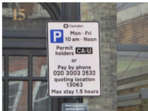
Loading and waiting restrictions: